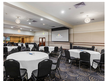
Lancell and Bassford space