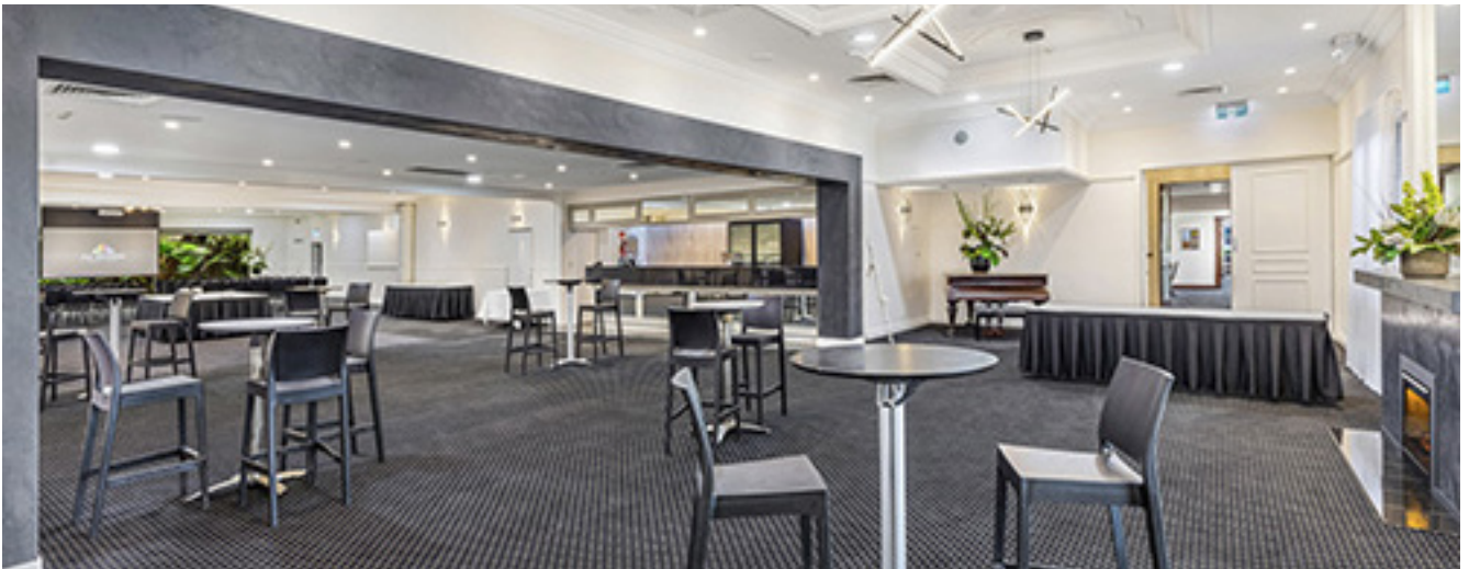
Trade table fernery space