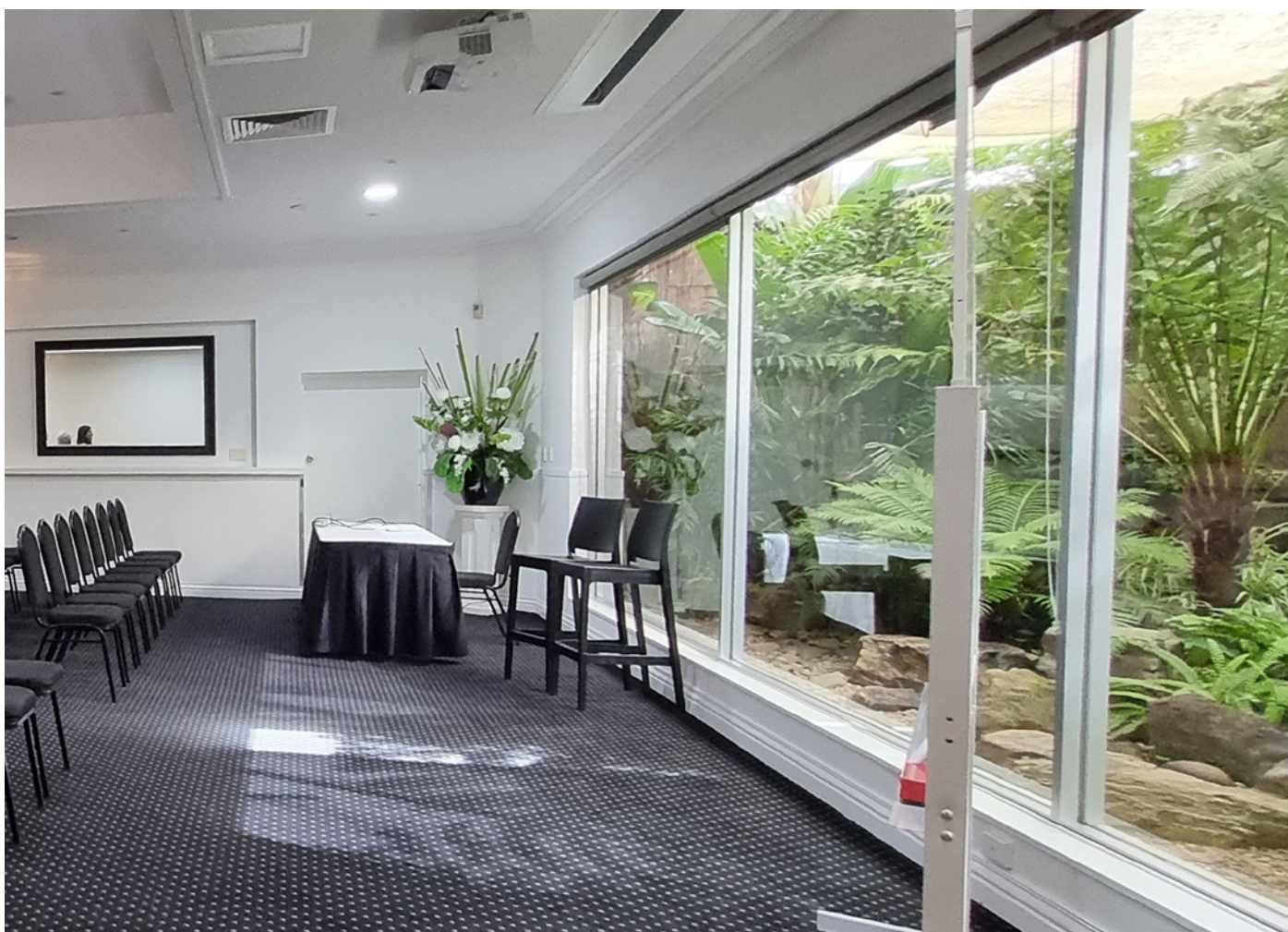
Fernery space allocated to Health & Wellbeing Sponsorship