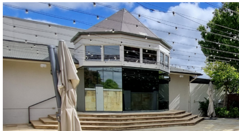
Cocktail Space / Atrium