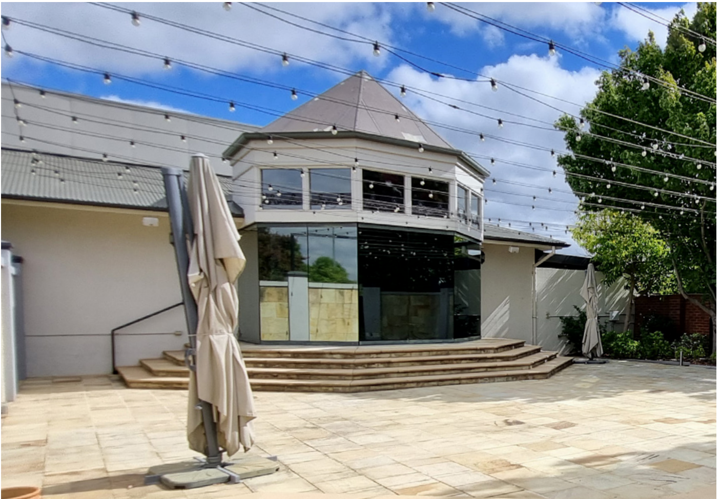
Cocktail Space / Atrium