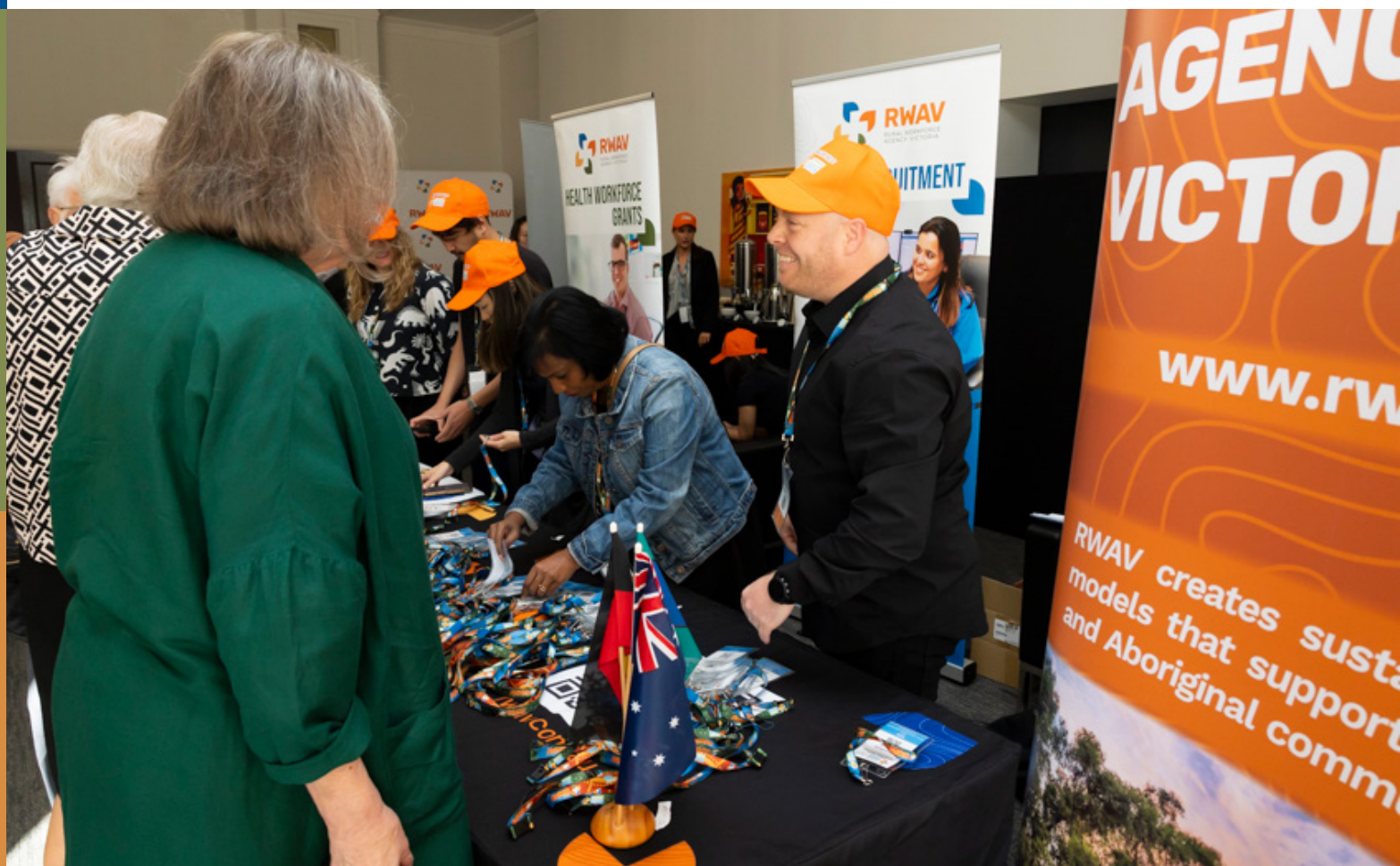
RWAV Conference 2023