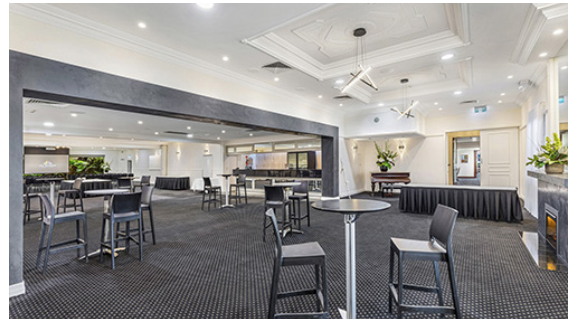
All Seasons Trade Table Space

Building on the success of the first two RWAV conferences, we have included workshops, more networking opportunities and greater networking space for sponsors and an exhibition space for trade tables plus additional sponsor opportunities.