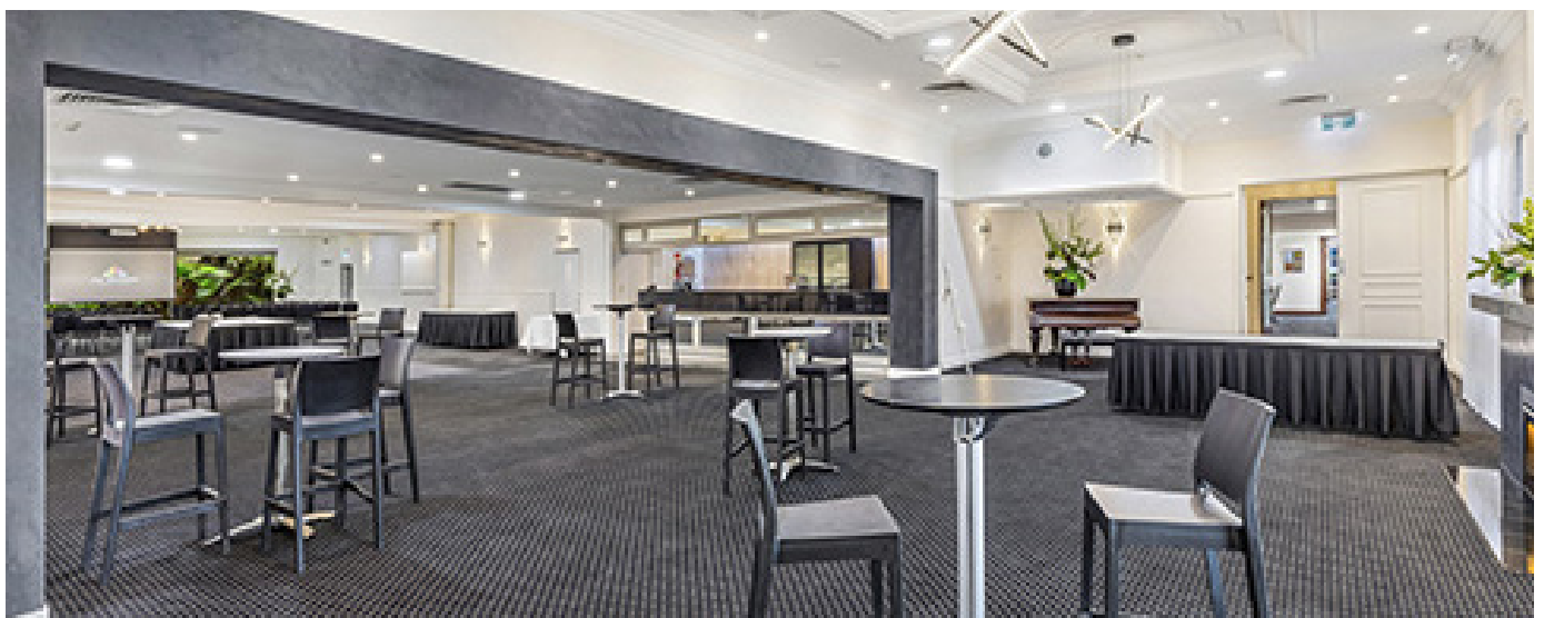
Trade table fernery space